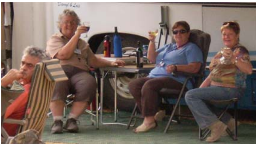
White's are orright!!

Please give our warmest regards to our fellow Bushwackers.