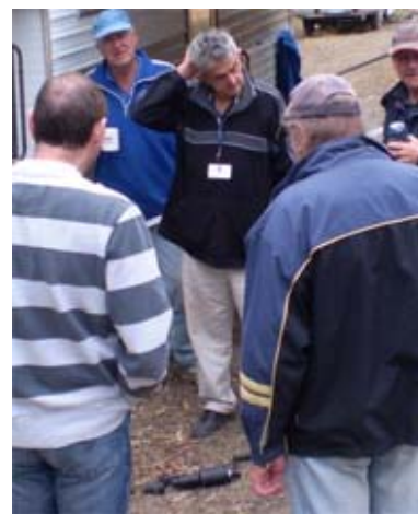
What is that thing?