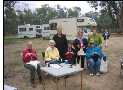
The knitters and talkers brigade at work!

The conversation around Saturday night's campfire was.....full of laughter and usual "pick on people" and yours truly copped a heap from the small group that lasted the longest. Please note - I'm actually in a couple of photos.....so there!!!