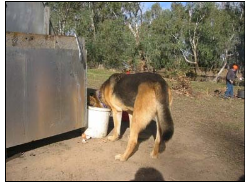
Maurie's pooch also enjoyed the brekkie!

With official business over, some people packed up to go home, others talked and talked, but the majority just lounged around. Some people stayed on till Monday, but our campfire numbers were not quite as large or as vocal as the previous night!!!