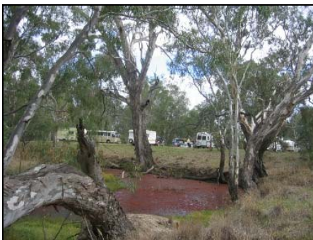
How good is this!

What a delightful spot to camp. It was a large flat open space beside the Broken River. A short walk took you to Casey's Weir - a small area but it ACTUALLY had WATER flowing over the spillway.....Wow!! Lots of birds completed the picture.