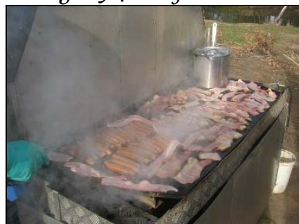
Even the bacon and snags are all in line!