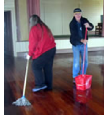
Big thanks to the volunteer brigade of hall decorators and cleaners.