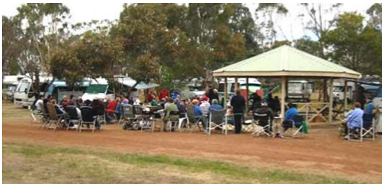
The Big Group