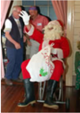
Santa arrived on a trolley and found a comfy chair to give out the large number of KK prezies amid laughter and frivolity.