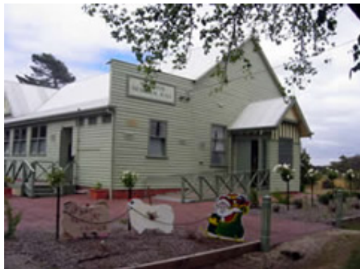
The Hall where we would have our tucker had a great historic past. It commenced life in 1906 as a Mechanics Institute, had a lending library with over 1000 books, held many magnificent balls, was a skating rink on Friday nights. Gas lighting was installed in 1914 and replaced with an electric lighting plant in 1947. Electricity from the State grid was connected in 1958. The hall was modernized and the Hon. Henry Bolte reopened it a Grand Ball.

With the weather settled, lots of Bushies explored the town and the wonderful history associated with it. The decoration of "Sheep" on fences and houses is unique. To quote from the "Meredith and District News". "It appears that the display will be bigger and better than past years as about 32 new sheep have been added to the flock and 12 sheep have been supplied to one family and are being decorated as the 12 days of Christmas". When you wander around, you see the plaques representing past information about each site, and the lovely walk from the hall showed us family names and histories in their own Avenue of Honour – what a great town for us city slickers to come across.