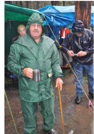
What the well dressed Bushies wear in the wet.