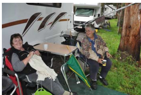
Rainy weather the ideal time for a chat and crochet