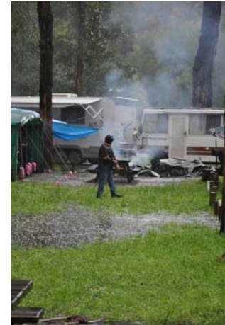
Who is this hooded man? Or is it a woman?