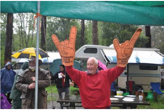
Told you it was going to stop!