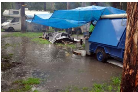
The trailer was sited lakeside

Another wise decision was Gleness' insistence that they move their motorhome on the Friday – Saturday saw the start of a small pond where it had been parked. Little did she know that the following day would see an absolute lake – they would have been bogged for sure.