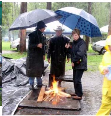
Rain is no deterrent to chatting around a fire