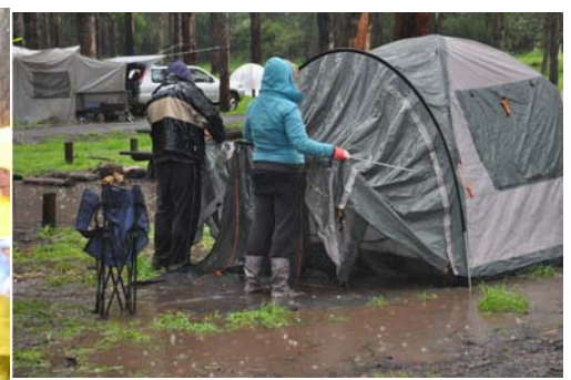
Times like this make you glad you have a motorhome.....

Many campers and horse people decided enough was enough and headed home, a few Bushies as well, some of whom had Melbourne Cup day commitments. But a lot decided to brave the patchy afternoon showers and stayed to cook on the open fire in the evening and sat around afterwards.