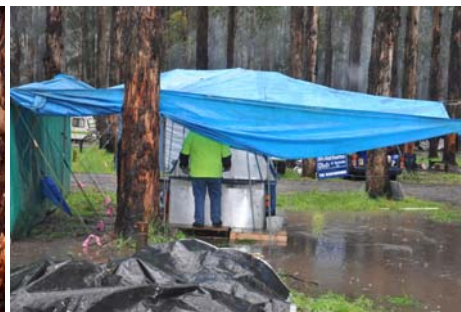
Theo "grew" an extra few inches while cooking