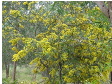
Lovely wattle in bloom was seen on the ladies' walk.