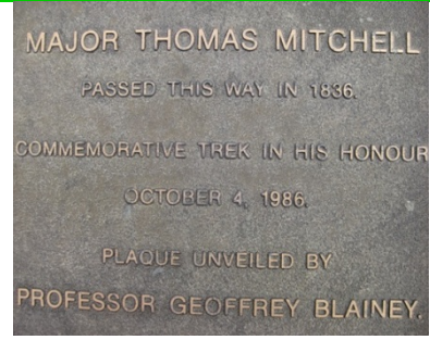
Major Mitchell explored the Redesdale area - thank you!