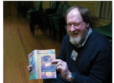
Terry found this old Wanderer magazine - much smaller than the current one.