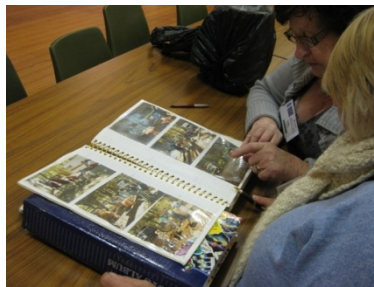
Some longer-serving Bushies helped to name lots of old photos - thanks.