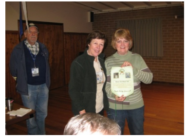
Thanks Chrissy for updating our Bushwacker Website.