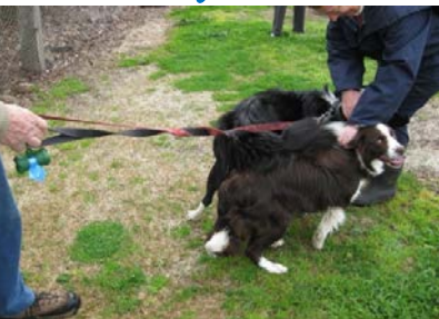
Nikki and Diesel got tangled together because they were excited when they saw the ladies.