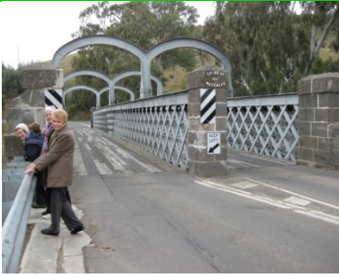
Some ladies walked to the old bridge.