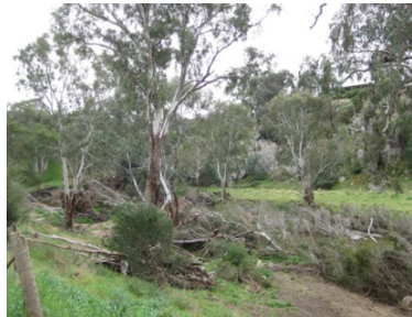
On the walk, lots of flood damage was seen lying around.