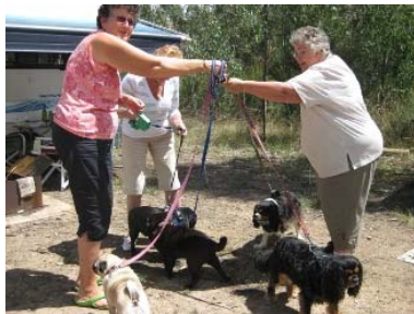
A dogs' 1 st May maypole?????

As the sun went down and the fire was lit (our wonderful Brookes Res. neighbour sure looked after us!), how terrific it was to be out in the bush.