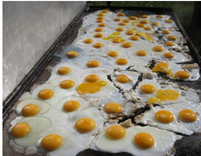
Yum yum! Eggsellent!