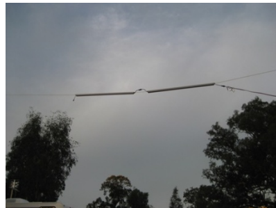
Bill's lights – a new meaning for suspenders???