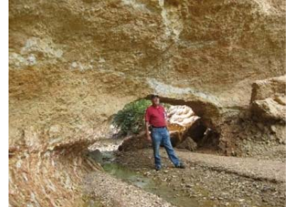
London Bridge/Tasman Arch??