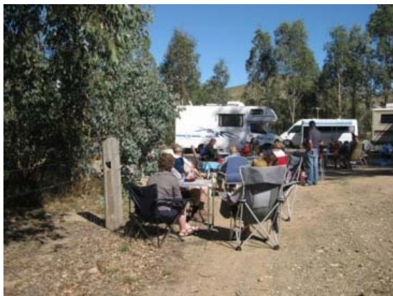
Brookes – a nice location

A mild night was around, no fire was poked. All we did was laugh and joked.