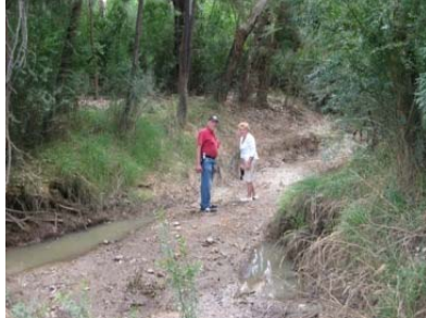
The start of the walk