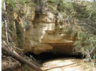
A DARK DARK cave!