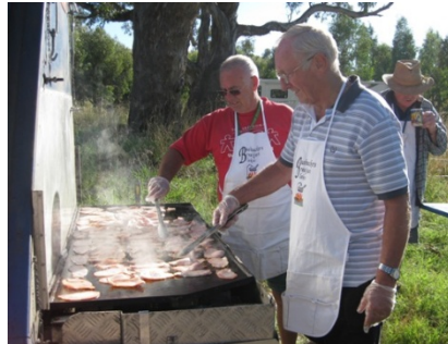
The bacon was good too!