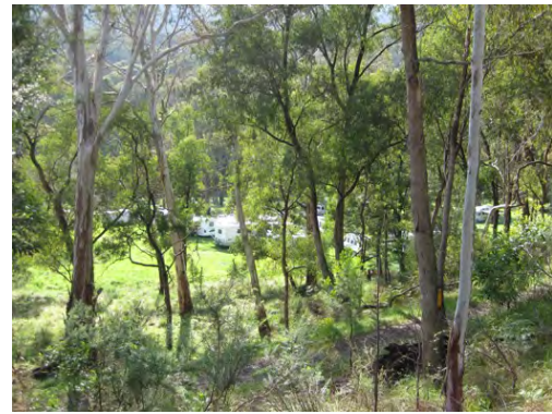
Look at our campsite, nestled happily among the trees.