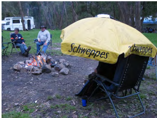
Who’s under this big broolly?