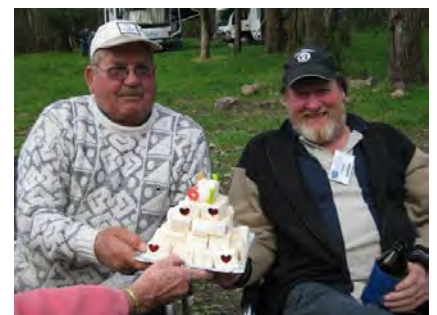
Happy birthday Bushies!