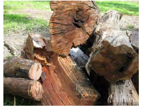
The amazing local wood that was chain-sawed and collected by some Bushie helpers.