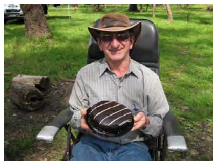
New Bushie.....No 2