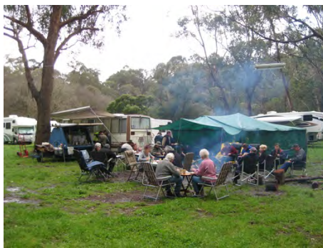
No, it's not "eyes down" for Bingo, but eyes down for eating and enjoying. The rain cleared too!