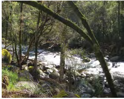
The nearby gushing Rubicon River – a beautiful sight in the early morning sunshine.