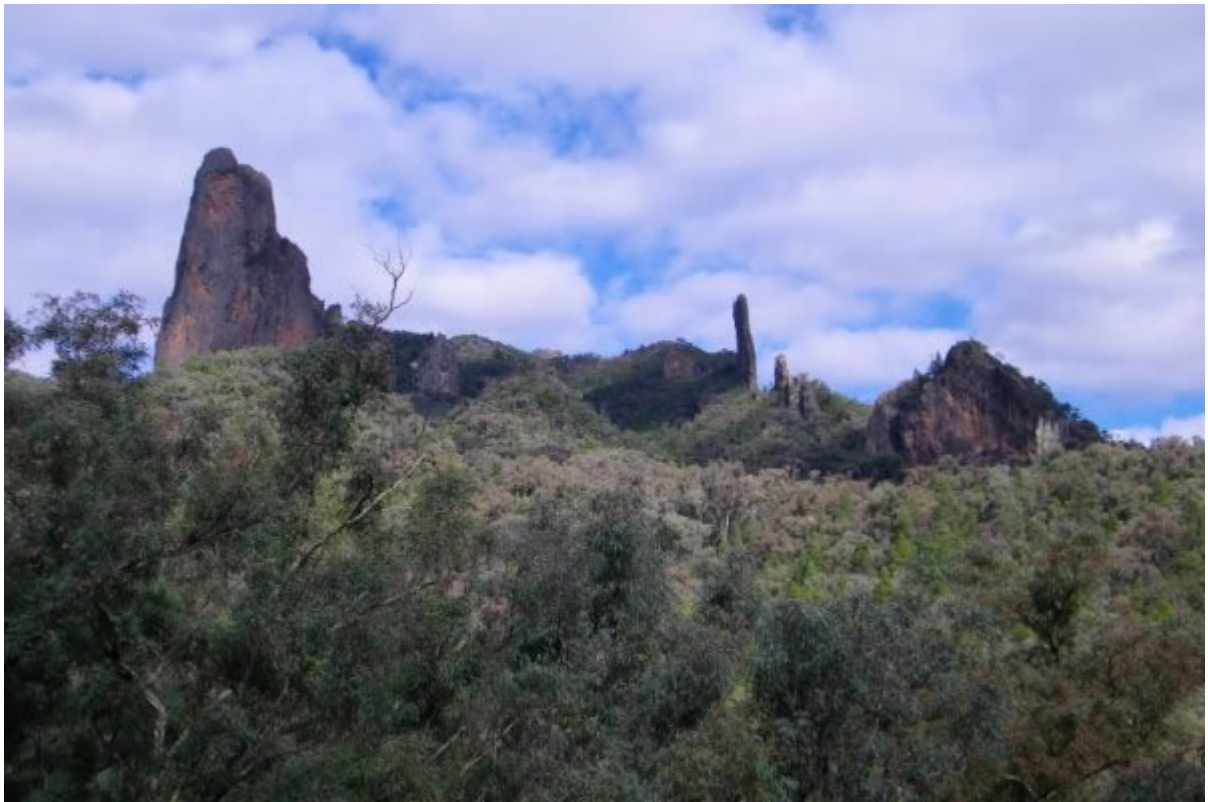
The Warrumbungles National Park