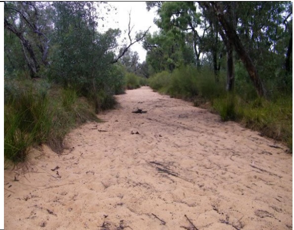
Forests and Rivers