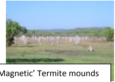
'Magnetic' Termite mounds line up north-south...

Down the highway To Humpty Do And on to Litchfield National Park. More savannah, ferns and pandanas Waterfalls a plenty And special termite mounds Which line up From north to south Their way Of temperature control As they stand like an army Ready for battle