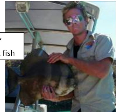
"Kevin" the bat fish

We continued up the creek through another funnel, not quite as narrow as the ones at the falls.