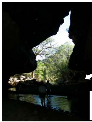
Inside looking out ... ...outside looking in