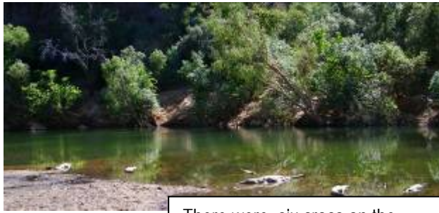
There were six crocs on the bank, all asleep and immobile...

After the story I soak up the surroundings now to quell my distaste of life and death long ago. I come upon a meeting of crocs.. sunning themselves and snoozing in the shallow water. A last glimpse along the beautiful gorge and morning tea awaited at the bus before we sped off towards Tunnel Creek, following the ancient reef as we bumped and bounced along the road. The carpark at Tunnel Creek was filled with 4WDs covered in red dust but Menashe found space for us under a shady tree and set up salads for lunch while we changed into 'tunnel clothes'.... The creek would be flowing but not as high as it had